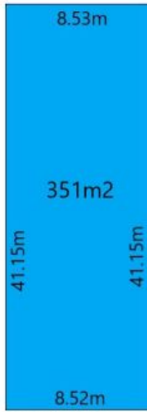
30 The Driveway