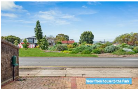
View from house to the Park