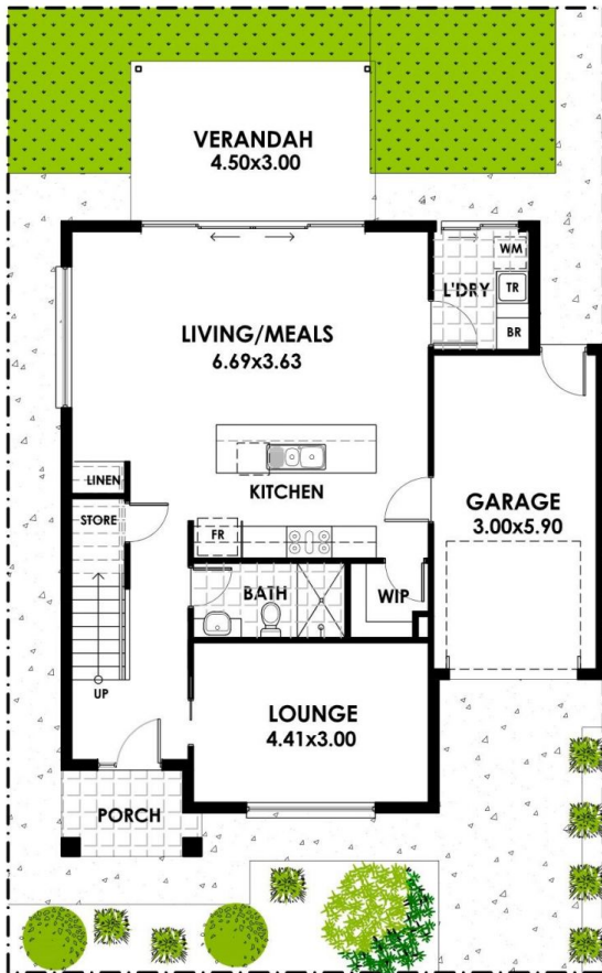
GROUND FLOOR / SITE PLAN