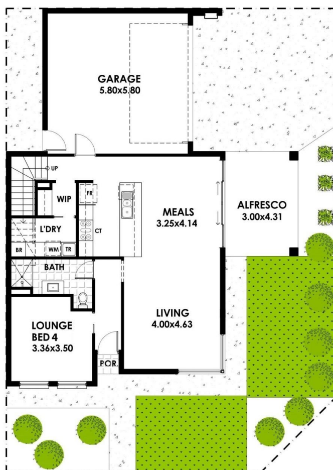
GROUND FLOOR PLAN SCALE 1:100 @ A3