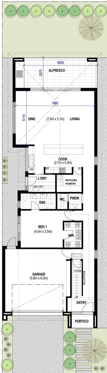
1 Level 00_FLOOR PLAN SCALE 1:100