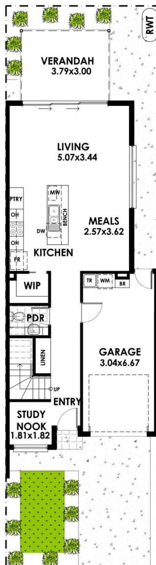
GROUND FLOOR / SITE PLAN