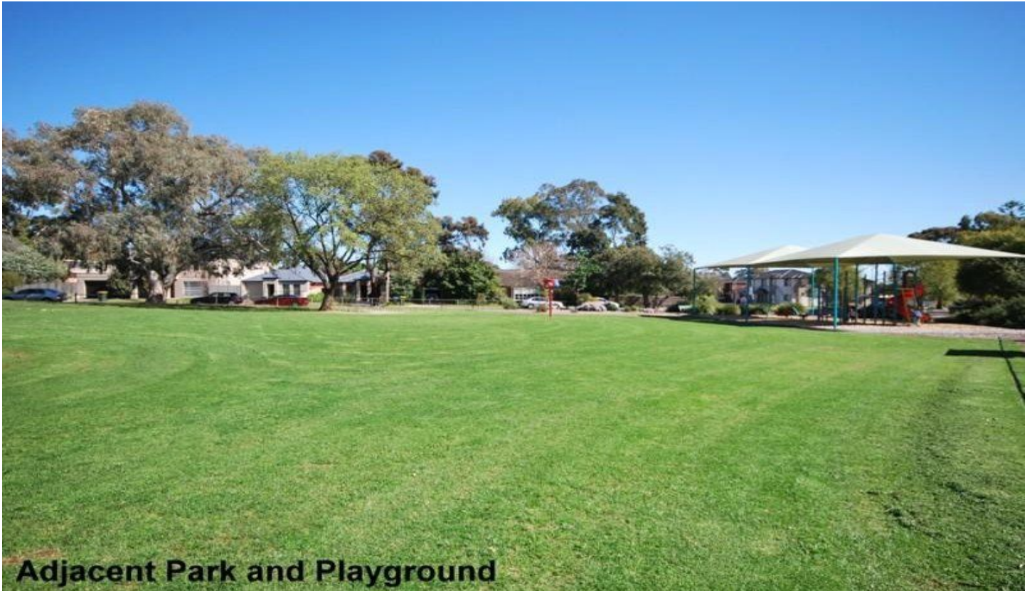
Adjacent Park and Playground