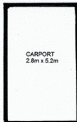
CARPORT 2.8m x 5.2m