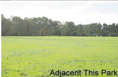
Adjacent This Park