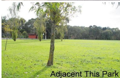
Adjacent This Park